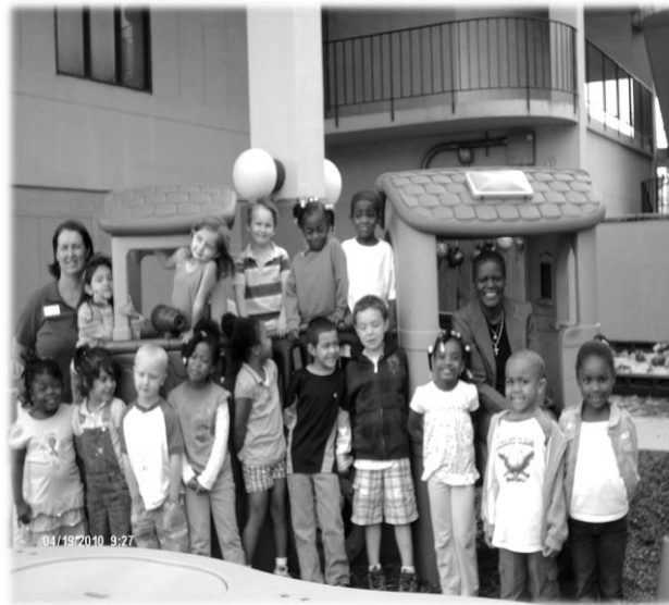
The "Blue Classroom" prepares for their next challenge

children singing songs and reciting poetry that have learned during their time at the CDC. The hour-long event will include refreshments for attendees.