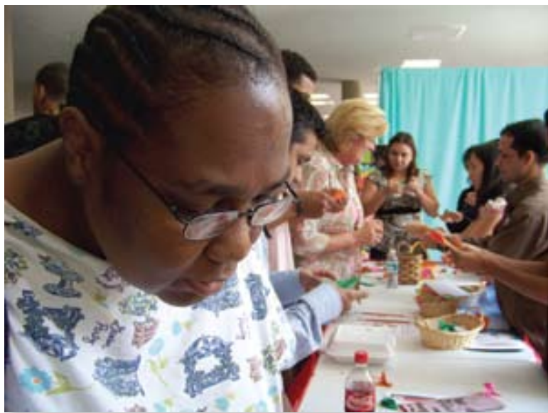
Spring Fling: EAP students man the Peace of Paper booth during the DM SGA Spring Fling.

Those who would like to learn more about the Peace of Paper project are encouraged to contact April Muchmore-Vokoun at 813.253.7360 or amuchmore-vokoun@hccfl.edu for more information.