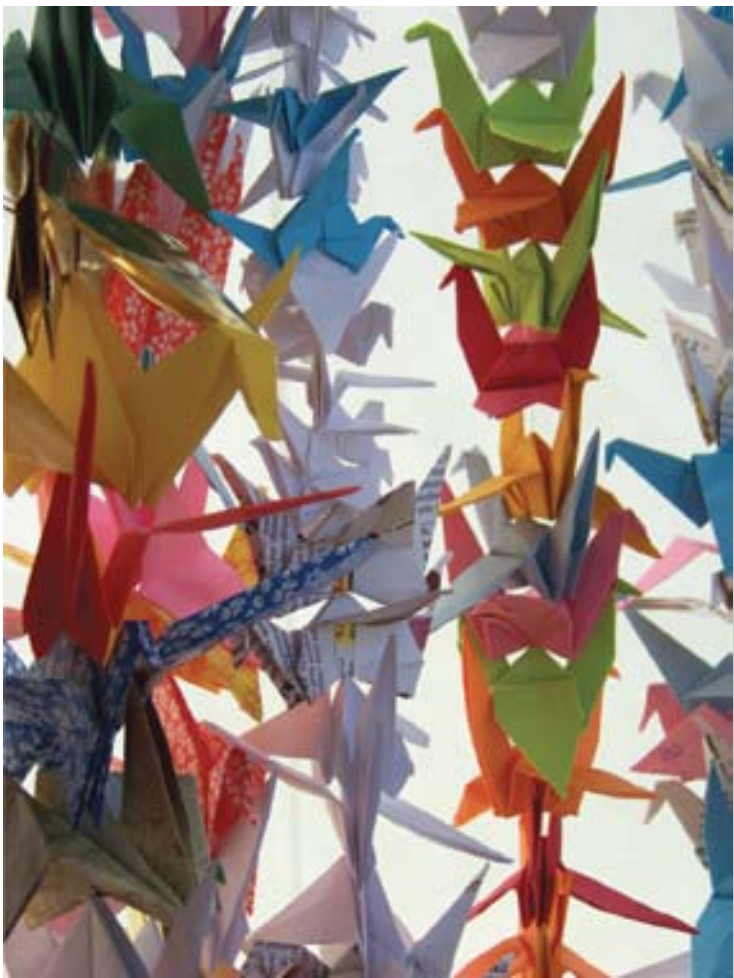
Crane Strands: EAP students used a variety of paper – from traditional origami to recycled copy paper - to create their cranes.