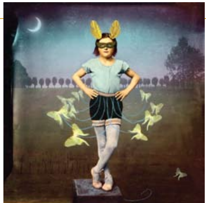
Moth Dancer - Maggie Taylor