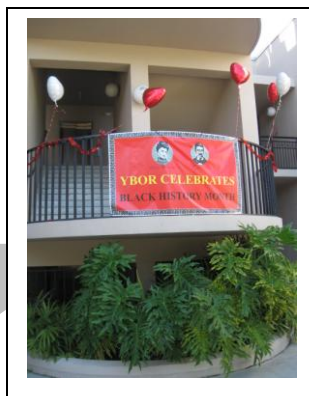
The jazz concert took place in the HCC-Ybor City Campus Courtyard February 14