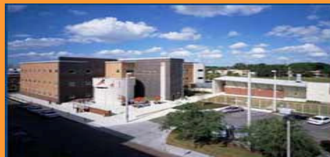
Ybor City Campus Public Services Technology Building Home to the Department of Criminology and Criminal Justice Studies

Want to socialize with students who share your interests. We have an active Criminal Justice Student Association