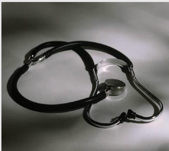
Figure 1. Label in 20pt Calibri.

To change the font style of this text box: Click on the border once to highlight the entire text box, then select a different font or font size that suits you. This text is Calibri 22pt and is easily read up to 4 feet away on a 24x36 poster.