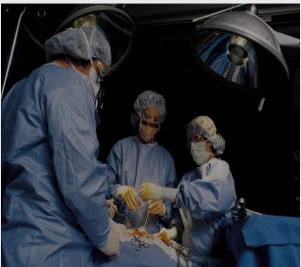
Figure 2. Label in 20pt Calibri.