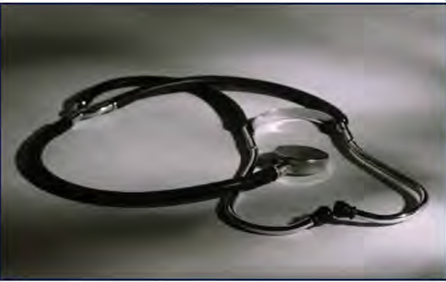
Figure 1. Label in 16pt Calibri.

We have more history with PowerPoint® than any other printing company. In fact, we helped Microsoft® design the software and we created all of the original color themes, templates, and clip art galleries. We know how to make your printed poster look just like it does on screen. Other printing companies and copy centers will blindly convert your file to another format prior to printing. This can result in text shifting, symbols changing, and altered colors. We know the secrets to avoid those issues. So choose Genigraphics for the most accurate reproduction available.