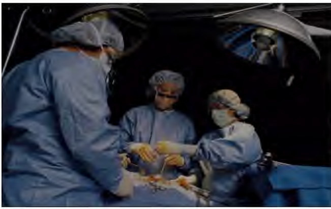
Figure 2. Label in 16pt Calibri.